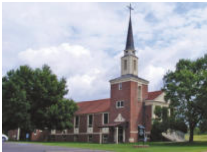
Hoyt Lakes 319 Kennedy Memorial Drive Hoyt Lakes, MN 55750 218-229-3210