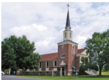
Hoyt Lakes 319 Kennedy Memorial Drive Hoyt Lakes, MN 55750 218-229-3210