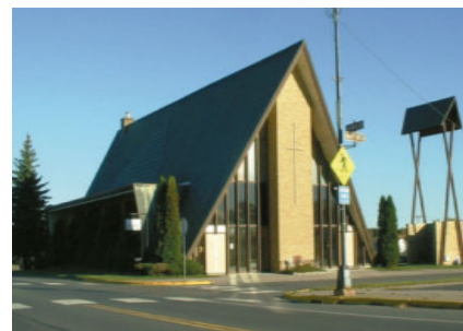
Biwabik 600 South Main Street Biwabik, MN 55708 218-229-3210