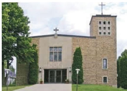
Aurora Main Office 16 West 5th Avenue N. Aurora, MN 55705