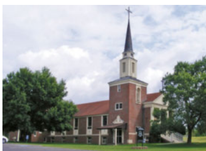
Hoyt Lakes 319 Kennedy Memorial Drive Hoyt Lakes, MN 55750 218-229-3210