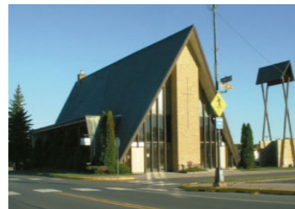
Biwabik 600 South Main Street Biwabik, MN 55708 218-229-3210