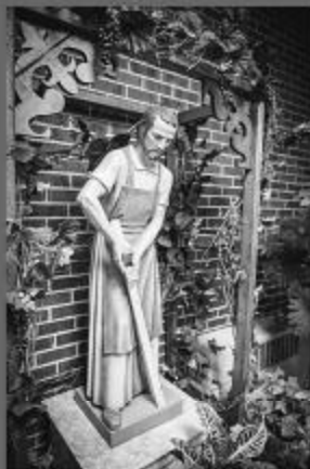
ST. JOSEPH THE WORKER

You have planted and harvested throughout your life the ability to have legacy gifts to leave to family and the causes you care about through your will or trust. If you are 55 and over, perhaps you have made these plans. If you have, you are actively harvesting the fruit of your work. As you continue to harvest, please prayerfully consider putting a gift in your basket for your parish to help sustain it for today and in the future. The Office of Stewardship and Development collects planned gifts from the faithful's baskets for parishes, schools, and ministries through the Catholic Legacy Society . Find the basket at CatholicPlannedGiving.com and click on the "Catholic Legacy Society" button for the notification form.