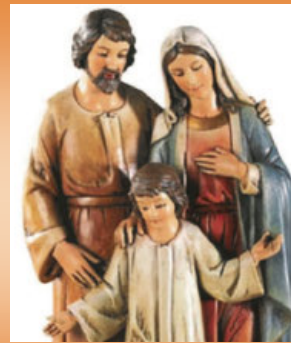
Holy Family Church 2 S Maddy St. McGregor