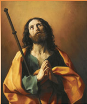
St. James Church 299 Red Oak Dr. Aitkin