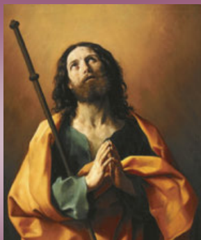
St. James Church 299 Red Oak Dr. Aitkin