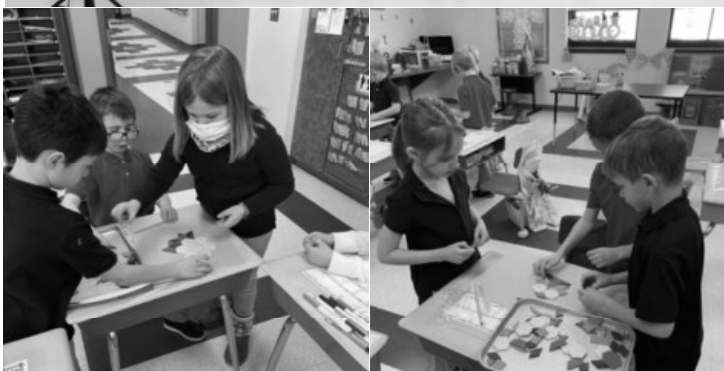
Learn about shapes and then create a design. First graders show terrific teamwork!