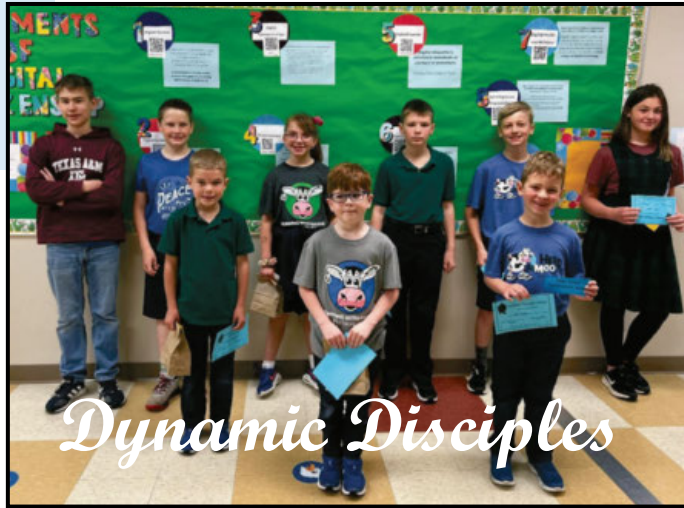
Congratulations to WEA's CYO Track & Field Team!