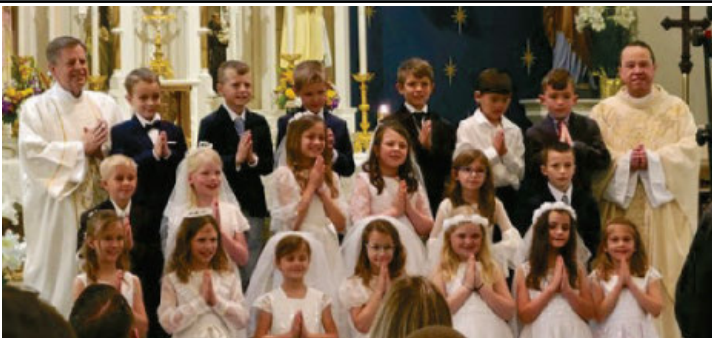
Congratulations to the children who made their First Communion on Saturday, April 30th.