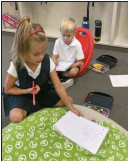
(above) 1st graders practice their writing skills.