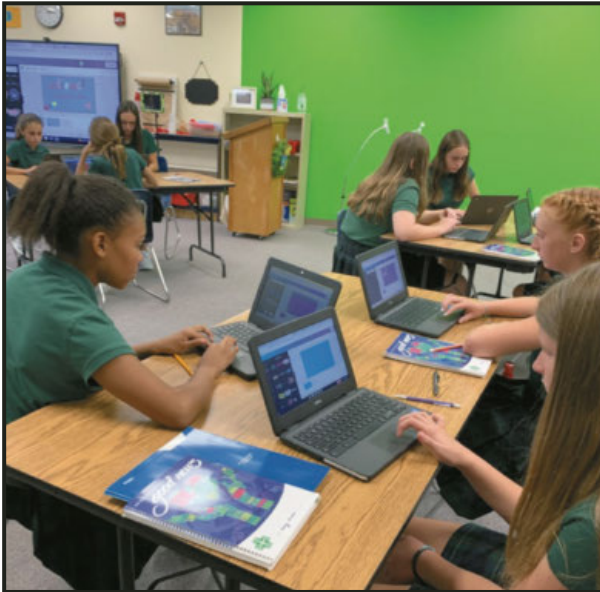
STREAM time! (above) Creating video presentations (left) "The Great Paper Chain Race"