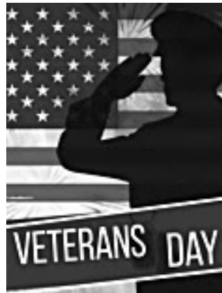
St. Martin of Tours, Pray for us!