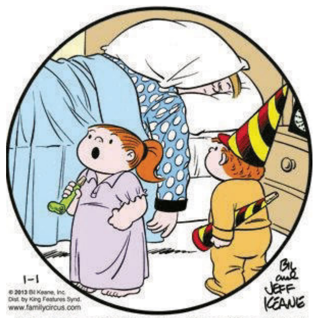
"Daddy said 'Happy New Year,' but I don't think he really meant it!"

Please watch your email and the bulletin for the current Ministry schedule.