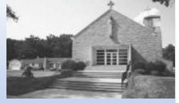
Saint Peter New Haven, IA