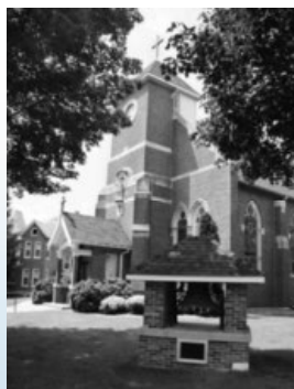
Saint Bernard Alta Vista, IA