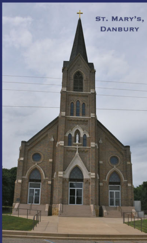
ST. MARY'S, DANBURY