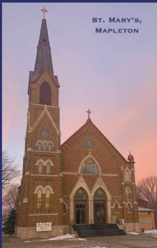
ST. MARY'S, MAPLETON