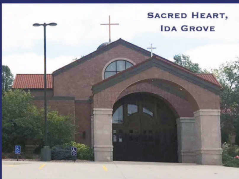
SACRED HEART, IDA GROVE

"Then, overcome by joy, I cried, Jesus, my love. At last I have found my vocation. My vocation is love. In the heart of the Church, my mother, I will be love, and then I will be all things." - St. Therese of Lisieux