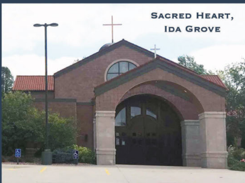
SACRED HEART, IDA GROVE

"I can nourish myself on nothing but truth" - St. Thérèse de Lisieux