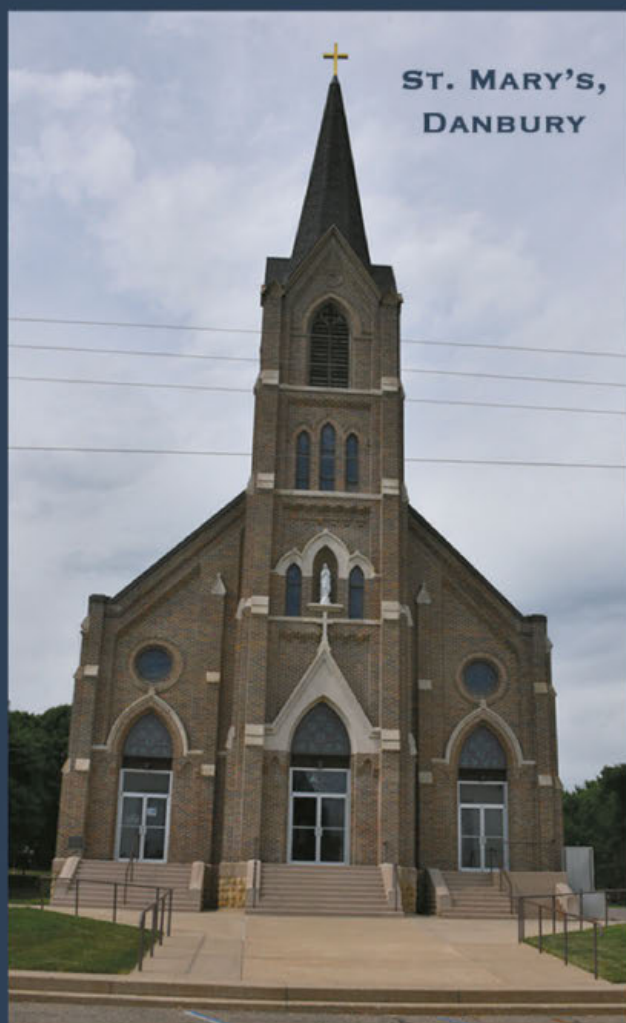
ST. MARY'S, DANBURY