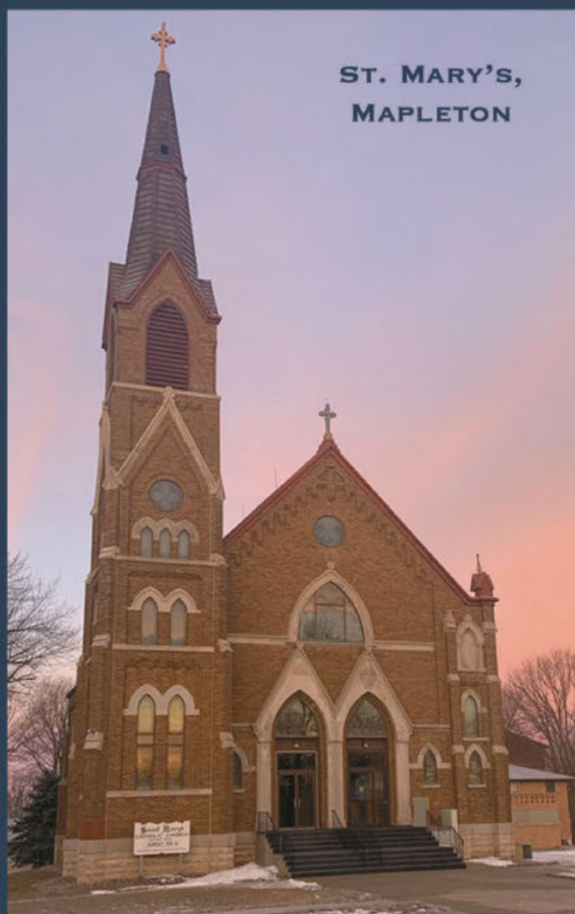
ST. MARY'S, MAPLETON