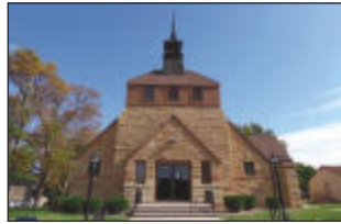
St. Joseph, Waldorf 225 3rd Ave N Established 1878 2028—150th Anniversary