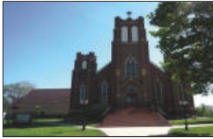
St. Ann, Janesville 313 W 2nd St Established 1874 2024—150th Anniversary

Three parishes working together to grow in faith, hope, and love.