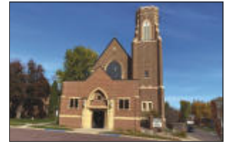
All Saints, New Richland 307 1st St SW Established 1879 2029—150th Anniversary