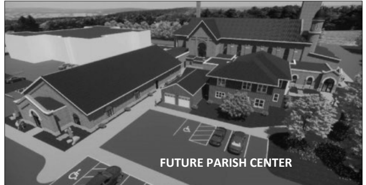
FUTURE PARISH CENTER