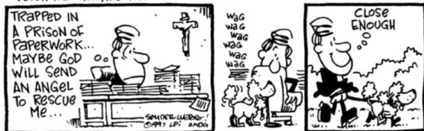
PETER AND PAUL, APOSTLES