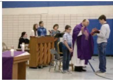
ASH WEDNESDAY AT ST. BENEDICT SCHOOL