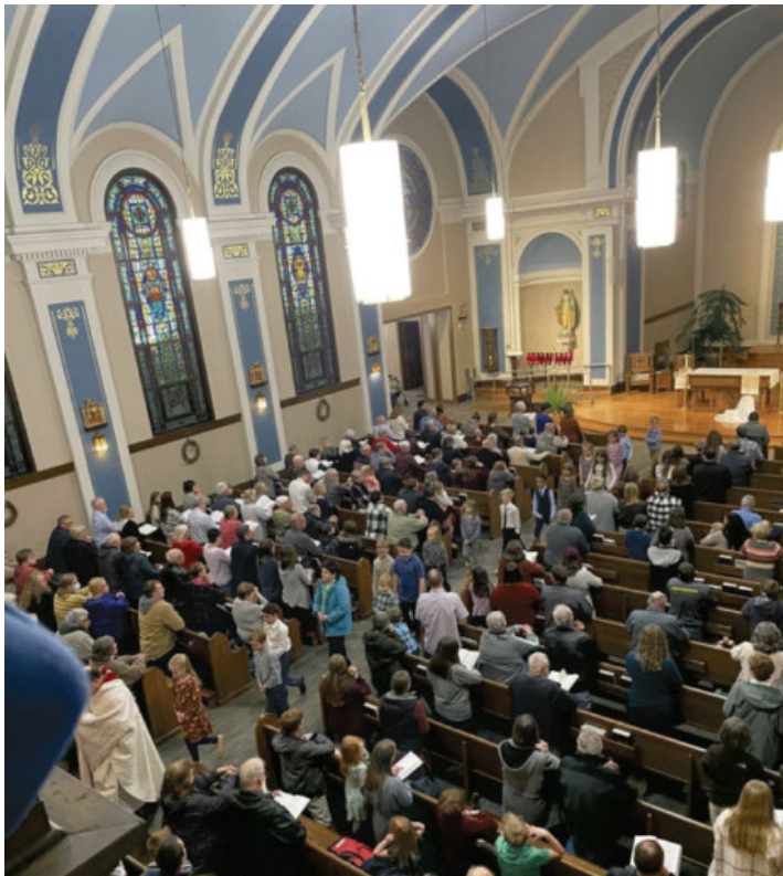
SECOND GRADERS AT HOLY THURSDAY Our second graders preparing for First Communion took part in the procession of the Eucharist at the end of Mass on Holy Thursday.