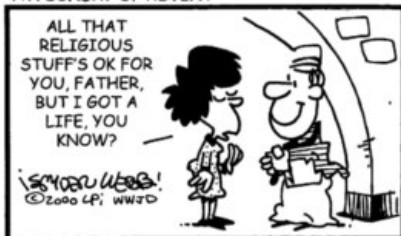
4TH SUNDAY OF ADVENT

Catholic Schools Week is Jan 30 - Feb 6. Join us for Catholic Schools Week Mass on Feb 6. Students of the school will be leading Mass. Stay tuned for more information!