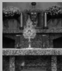
MIC - Thursdays 8:00 AM - 7:00 PM