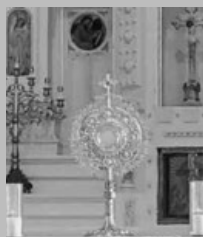
SSPP - Wednesdays 9:00 AM - 6:00 PM