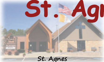
St. Agnes 210 Division Street, Walker

www.stagnesandsacredheart.com PO Box 874, Walker, MN, 56484 Monday-Thursday 8:30am-12:00 pm PH:218-547-1054— FX: 218-547-6327