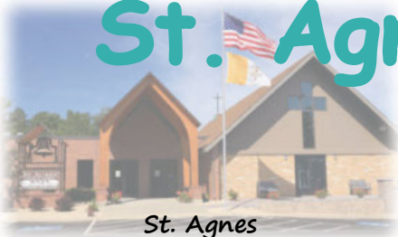
St. Agnes 210 Division Street, Walker