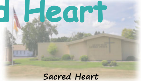
Sacred Heart 300 First Street

www.stagnesandsacredheart.com PO Box 874, Walker, MN, 56484 Monday-Thursday 8:30am-12:00 pm PH:218-547-1054— FX: 218-547-6327