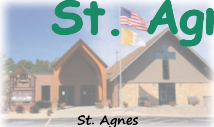
St. Agnes 210 Division Street, Walker

www.stagnesandsacredheart.com PO Box 874, Walker, MN, 56484 Monday-Thursday 8:30am-12:00 pm PH:218-547-1054— FX: 218-547-6327