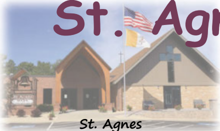
St. Agnes 210 Division Street, Walker

www.stagnesandsacredheart.com PO Box 874, Walker, MN, 56484 Monday-Thursday 8:30am-12:00 pm PH:218-547-1054— FX: 218-547-6327