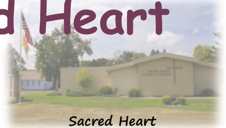
Sacred Heart 300 First Street North, Hackensack

www.stagnesandsacredheart.com PO Box 874, Walker, MN, 56484 Monday-Thursday 8:30am-12:00 pm PH:218-547-1054— FX: 218-547-6327