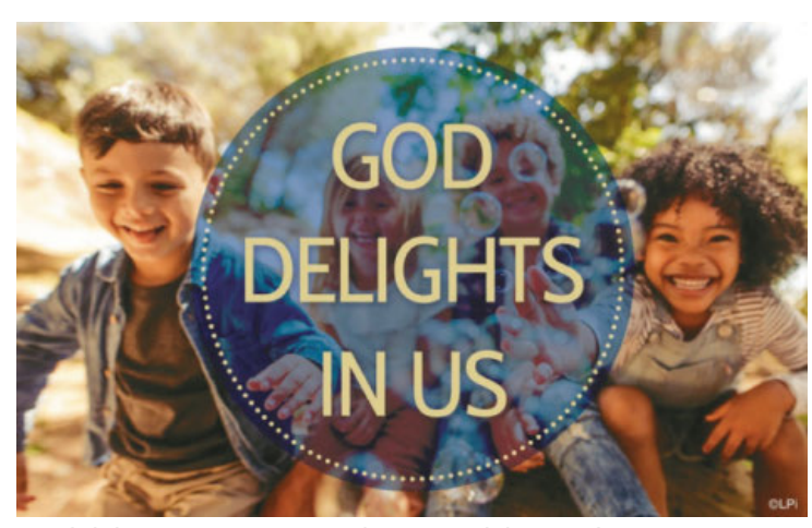
GOSPEL MEDITATION - ENCOURAGE DEEPER UNDERSTANDING OF SCRIPTURE

January 16, 2022 2nd Sunday in Ordinary Time