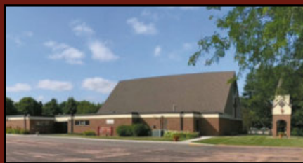
CHURCH OF ST. PAUL