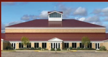
CHURCH OF ST. PETER