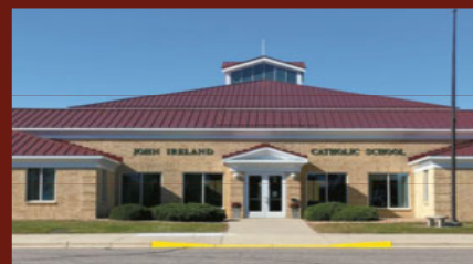
JOHN IRELAND SCHOOL