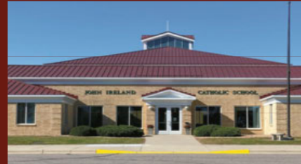
JOHN IRELAND SCHOOL