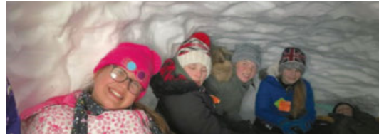
6th Grade Annual Trip to Wolf Ridge Environmental Center

THANK YOU —Thank you for supporting our annual Luck of the Irish run and event! Thank you for your prayers, participation, and donations.