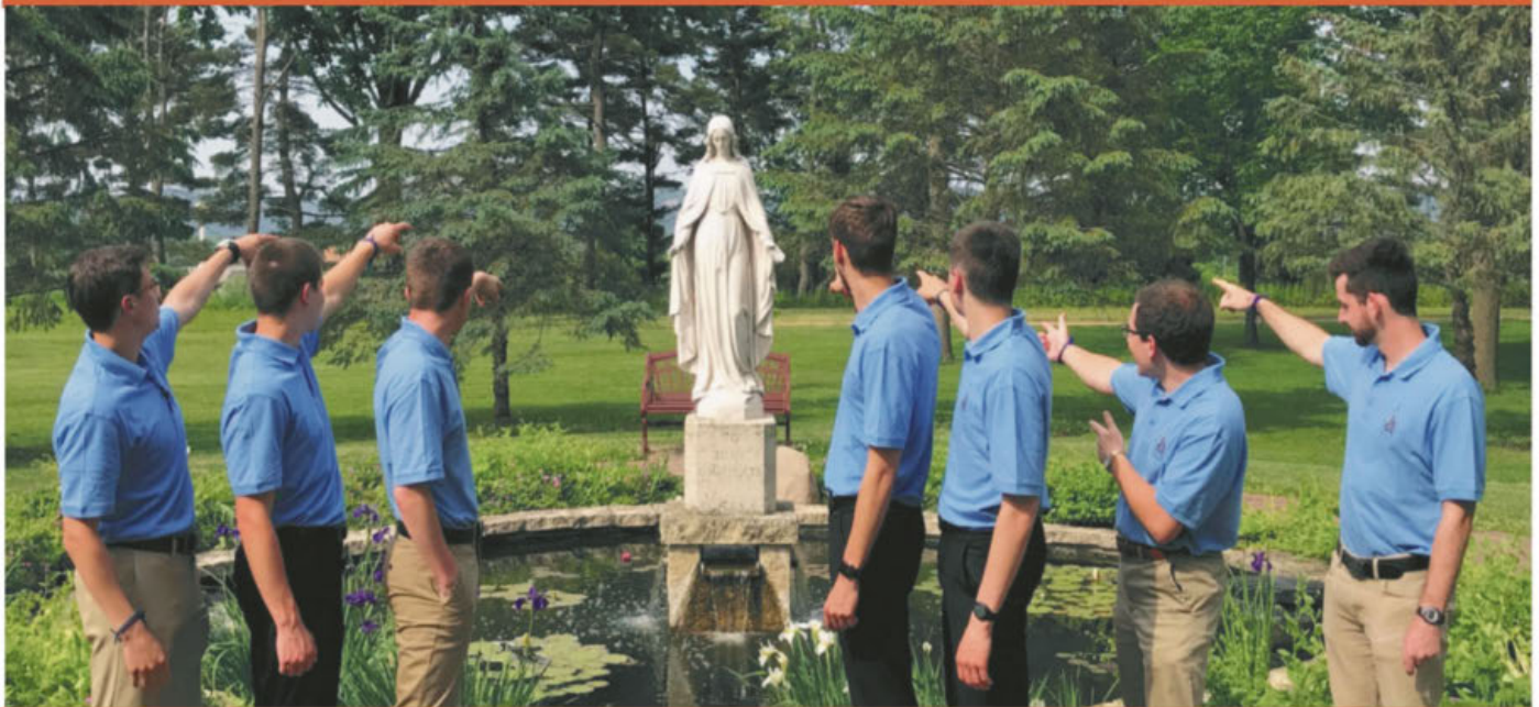
TOTUS TUUS...TOTALLY YOURS THROUGH MARY!

Bring the good news to the next generation; share the faith, build friendships, answer the call and become a 2022 Totus Tuus Summer Missionary in the Archdiocese of Saint Paul and Minneapolis!