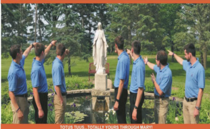
TOTUS TUUS...TOTALLY YOURS THROUGH MARY!

Bring the good news to the next generation; share the faith, build friendships, answer the call and become a 2022 Totus Tuus Summer Missionary in the Archdiocese of Saint Paul and Minneapolis!