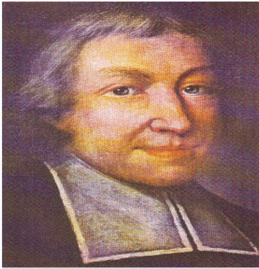
St. John Baptist de La Salle ~ Pray for us! Live Jesus in our hearts ~ Forever!