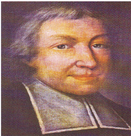
St. John Baptist de La Salle ~ Pray for us! Live Jesus in our hearts ~ Forever!