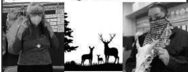
PreK-4th learned about waawaashkeshi, white tailed deer. Students listened to stories and learned facts about this common animal.