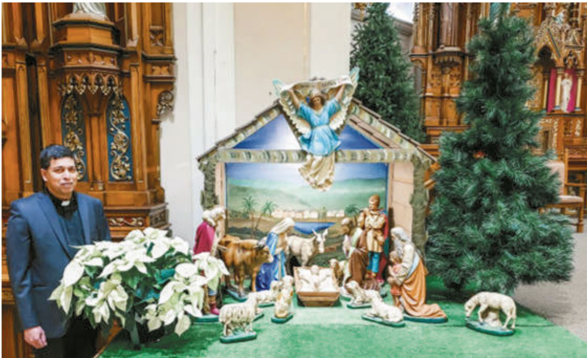
Nativity Scene 2021 at Our Lady of the Lake Church, Ashland

The birth of Jesus could lead us to truth, life, light, new beginning, and to a jump-start. He comes with Good News to reclaim everyone to God. Let the peace of Christ calm our anxieties, worries, frustrations, and lead us to healing, give us hope and rejuvenating divine life within us.