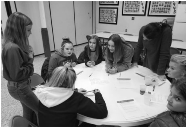
Family of Faith – Preparing for Jesus Christ Our King