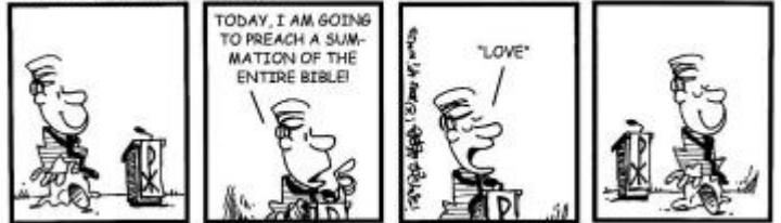
30TH SUNDAY IN ORDINARY TIME

Sunday: Ex 22:20-26/Ps 18:2-3, 3-4, 47, 51 [2]/1 Thes 1:5c-10/Mt 22:34-40; St. Antonio de Sant'Anna Galvao Monday: Eph 4:32—5:8/Ps 1:1-2, 3, 4 and 6 [cf. Eph 5:1]/Lk 13:10-17; St. Peter of Alcantara Tuesday: Eph 5:21-33/Ps 128:1-2, 3, 4-5 [1a]/Lk 13:18-21; Blessed Bartholomew of Vicenza Wednesday: Eph 2:19-22/Ps 19:2-3, 4-5 [5a]/Lk 6:12-16; Sts. Simon and Jude Thursday: Eph 6:10-20/Ps 144:1b, 2, 9-10 [1b]/Lk 13:31-35; St. Narcissus of Jerusalem Friday: Phil 1:1-11/Ps 111:1-2, 3-4, 5-6 [2]/Lk 14:1-6; St. Alphonsus Rodriguez Saturday: Phil 1:18b-26/Ps 42:2, 3 5cdef/Lk 14:1, 7-11; St. Wolfgang of Rebenburg Next Sunday: Rv 7:2-4, 9-14/Ps 24:1bc-2, 3-4ab, 5-6 [cf. 6]/1 Jn 3:1-3/Mt 5:1-12a