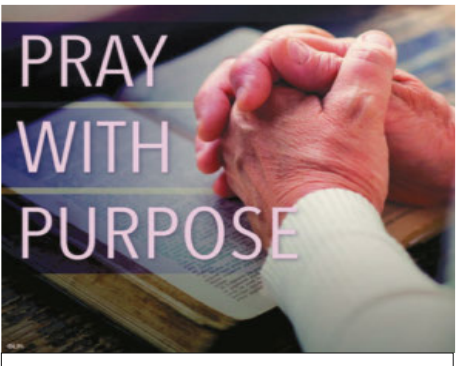
National Day of Prayer May 5, 2022

"Rivers do not drink their own water; trees do not eat their own fruit; the sun does not shine on itself, and flowers do not spread their fragrance for themselves. Living for others is a rule of nature. We are all born to help each other. No matter how difficult it is ... life is good when you are happy; but much better when others are happy because of you." ~Pope Francis