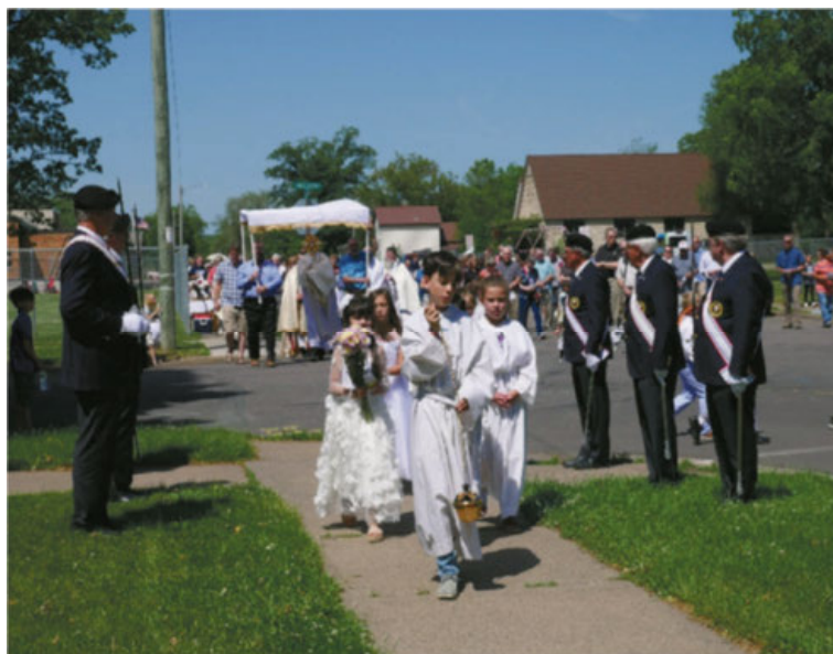
First Communion children lead the procession in downtown Rice Lake. Knights of Columbus Councils, 2137 and 9546, fourth degree knights were in full regalia.

In the Four-Parish cluster, we host two 24/7 adoration chapels: St. Joseph Church (Rice Lake) and Our Lady of Lourdes (Dobie). Our prayer is that the National Eucharistic Revival will be a way to increase the number of adorers for our chapels and to educate the faithful on the true presence and fruits of Jesus. For those interested in learning more about adoration in the four-parish cluster and/or who would like to sign up for an hour, please contact our administrative office at 715-234-2032 .