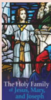
The Holy Family of Jesus, Mary, and Joseph

On this, the Sunday within the Octave of Christmas, we honor the Holy Family of Jesus, Mary and Joseph. In honoring them, we also honor all families, big or small. Reflect, today, upon your own family life. Some families are strong in virtue, some struggle with basic communication. Some are faithful day in and day out, some are broken and deeply wounded. No matter the case, know that God wants to enter more deeply into your family life just as it is right now. He desires to give you strength and virtue to live as the Holy Family. Surrender yourself and your family, this day, and invite the Triune God to make your family a holy family.