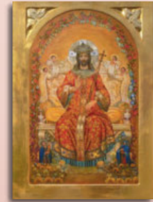
Christ the King Catholic Church