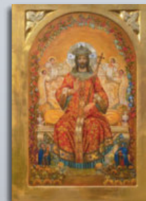
Christ the King Catholic Church