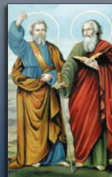
Sts. Peter & Paul Catholic Church