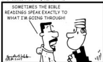
3RD SUNDAY IN ORDINARY TIME

Tri Parish Directory: We are going to be updating our directory, and making it a tri-parish directory. We are in need of several volunteers from our parish to work with our pages. If you are interested, please call the office at 763-444-4035.