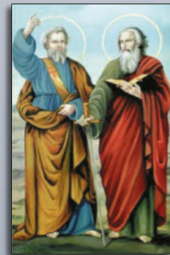
Sts. Peter & Paul Catholic Church