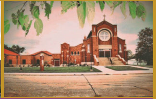
ST JOSEPH 510 Tipton St., Salix, IA