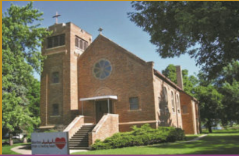
ST BERNARD 201 Main St. Blencoe, IA