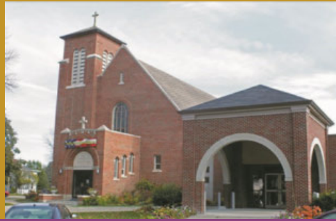
ST JOHN 1009 13th St., Onawa, IA