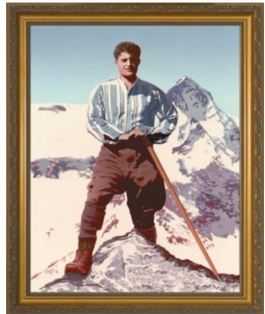
Blessed Pier Giorgio Frassati