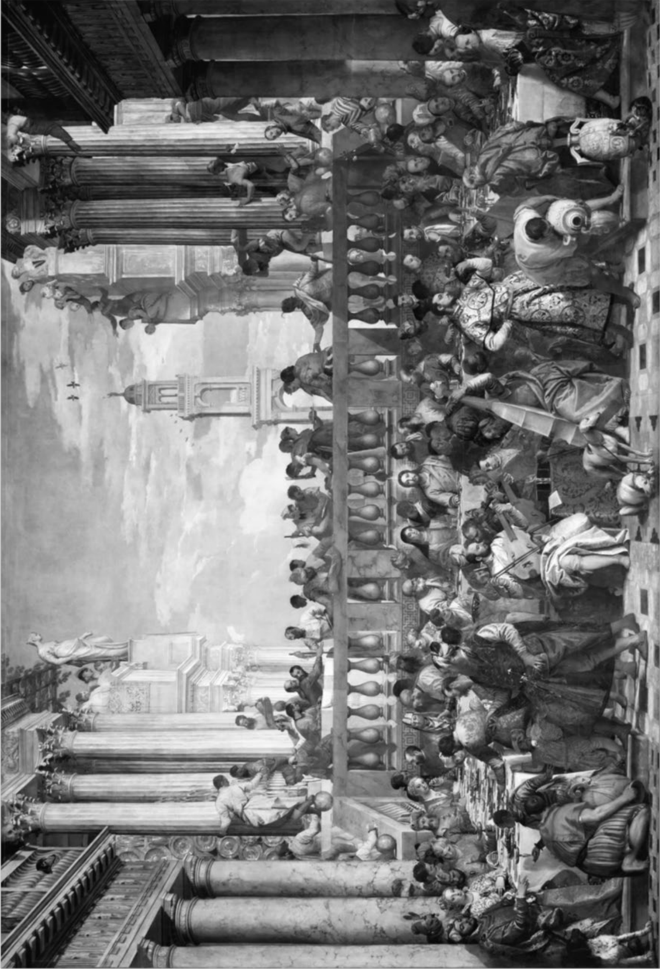
The Wedding at Cana Paolo Veronese (1528–1588) Public Domain