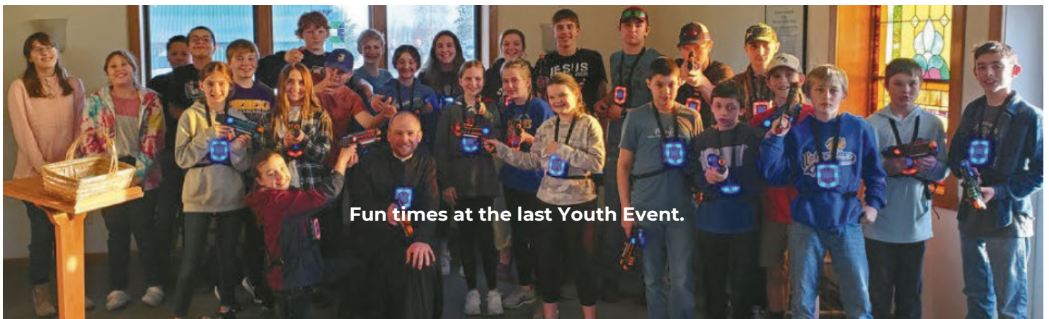
Fun times at the last Youth Event.