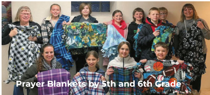
Prayer Blankets by 5th and 6th Grade