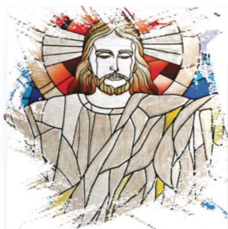
"HIS FATHER ORDERED HIS SERVANTS, 'LET US CELEBRATE WITH A FEAST, BECAUSE THIS SON OF MINE WAS DEAD, AND HAS COME TO LIFE AGAIN.'" - LK 15:24A

SACRED HEART BREWSTER will be hosting the Winona-Rochester Council of Catholic Women WOMEN'S LENTEN RETREAT on Sat., April 5th, 2025 at 9:00am. You have the opportunity to attend Mass, spend time in Adoration and complete Reconciliation. This is a great event to enhance your Lenten journey this year! All Women are invited.