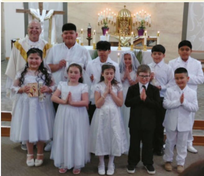
ST FRANCIS XAVIER, WINDOM