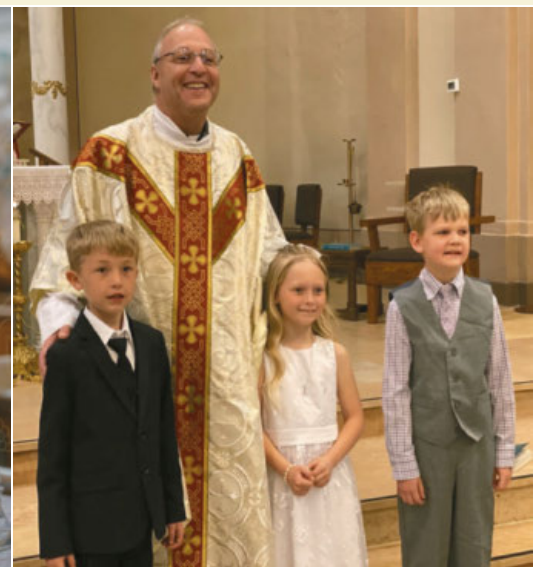
SACRED HEART, HERON LAKE